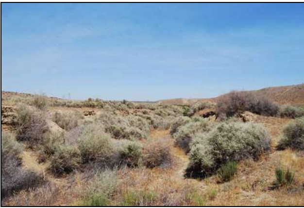
A. polycarpa at the Little Panoche Reservoir Wildlife Area.