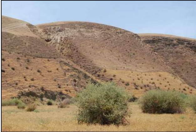
A. polycarpa at the Little Panoche Reservoir Wildlife Area (managed by the California Department of Fish and Game).