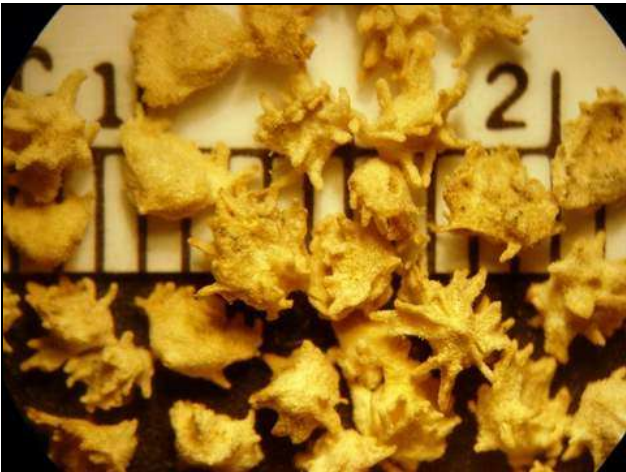
Each A. polycarpa seed is enclosed within fruiting bracts. Scale shown is millimeters.