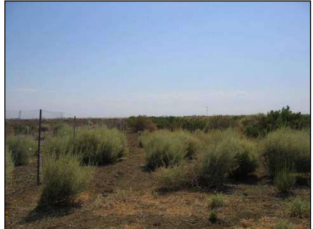
A. polycarpa volunteers growing at the native plant nursery. Through seed dispersal, the species frequently became established in areas of the nursery where it had not been planted.